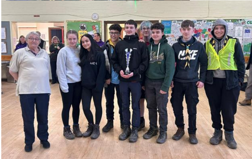
3. The O’Flaherty Trophy for the winning explorer team was won by the “HiRizz” Team from Seabourne ESU.

Everyone agreed that it had been a fantastic