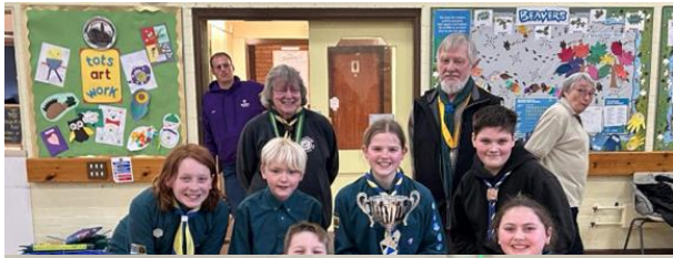
2. The Dunlop Trophy for winning scout team was won by the “Banana Tree” Team from 4th Denton.